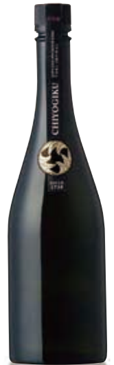
CHIYOGIKU BLACK YUKI JUNMAI Alc15% 720ml

JAS有機認定を受けた「日本晴」を磨き上げた至極の酒。吟醸の香り、すっきりとした味わいは高級なワイン以上に飲む人を魅了。