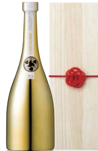
CHIYOGIKU PLATINUM GOLD Alc15% 720ml

CHIYOGIKU PLATINUM GOLD is the incarnation of uncompromised passion by "Toji". Brewed from the JAS certified organic Nihonbare rice, which is polished to only its 35% for use, it is filled with gorgeous flavor but extremely tender and dry taste. The sake is the supreme Japanese sake featuring generously scattered gold foil.