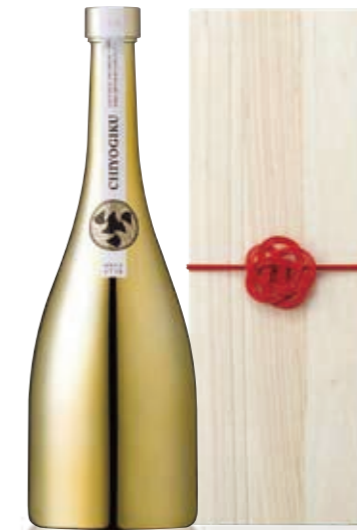
CHIYOGIKU GOLD YUKI JUNMAI DAIGINJYO Alc15% 720ml

35%まで磨き上げた有機認定の「日本晴」を丁寧に醸した社氏入魂の酒。華やかな吟醸香と淡麗で辛口な味わいは飲む程に杯が重なる逸品です。そこへ金箔を惜しげもなく入れたシリーズ最高峰の日本酒。